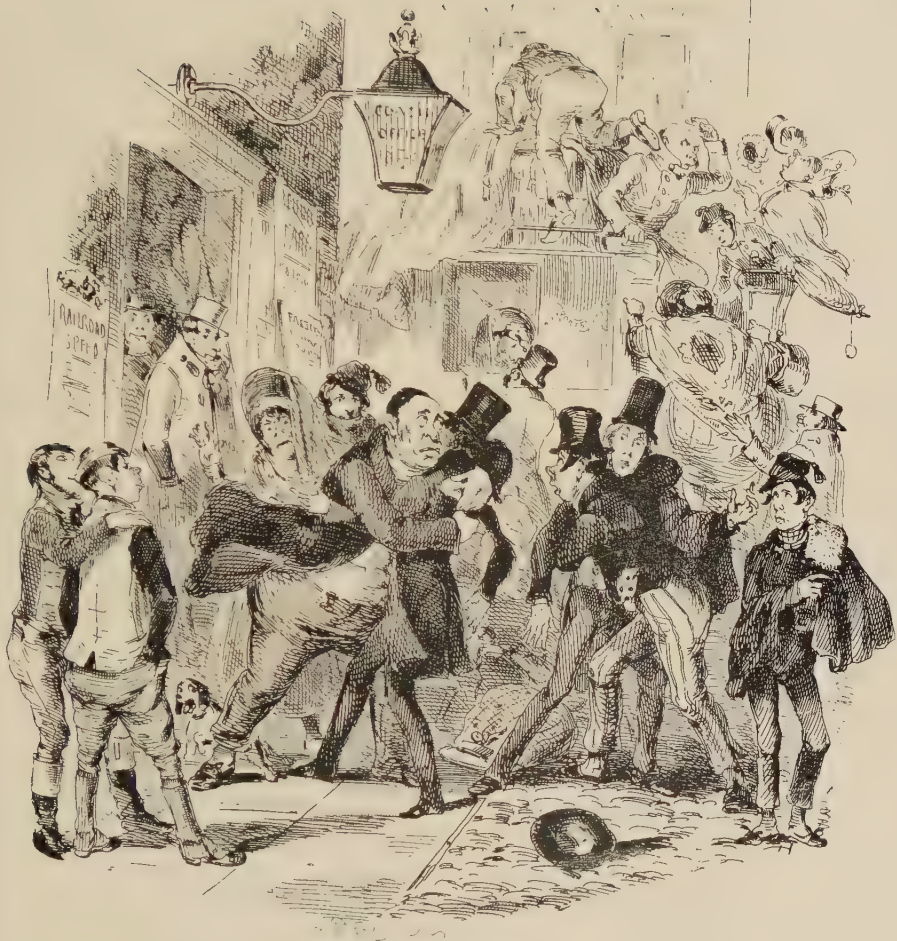
THEATRICAL EMOTION OF MR. VINCENT CRUMMLES.